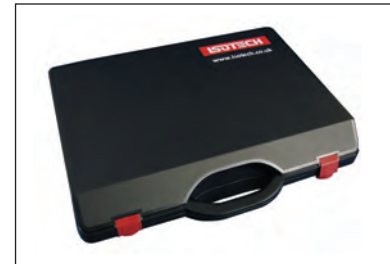
931-22-106 Optional Carrying Case

The TTI-22 includes Cal Notepad software for easy monitoring and logging of data. It is fully compatible with Isotech I-Cal Easy which can automate comparison calibration.