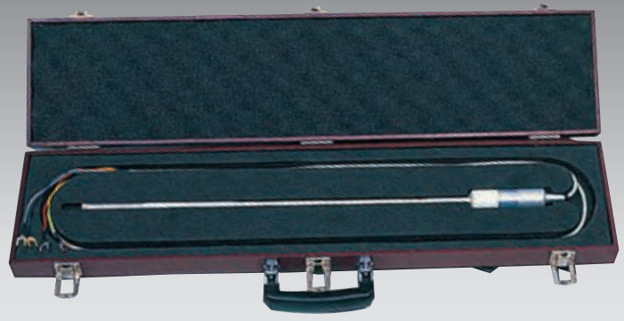
Super Stable Standard Platinum Resistance Thermometer

The 670SQ 650mm long is our recommended SPRT offering ultra stability, and has superior vibration, shock, immersion and self heating characteristics. From the success of the original Model 670 SPRTs we have introduced new models into the 670 range offering metal sheathed and low temperature models.