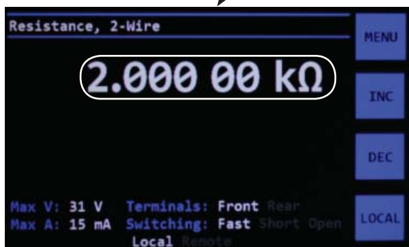
Source Resistance Screen

Touch resistance value to bring up entry screen or just enter resistance using keypad