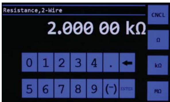
Resistance Entry Screen allows use of keypad or touchscreen to enter resistance value

See relevant setup parameters on the main screen