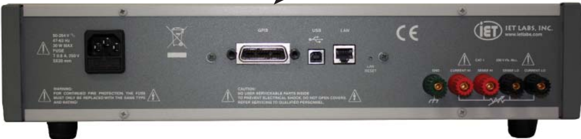
PRS-330 Rear Panel