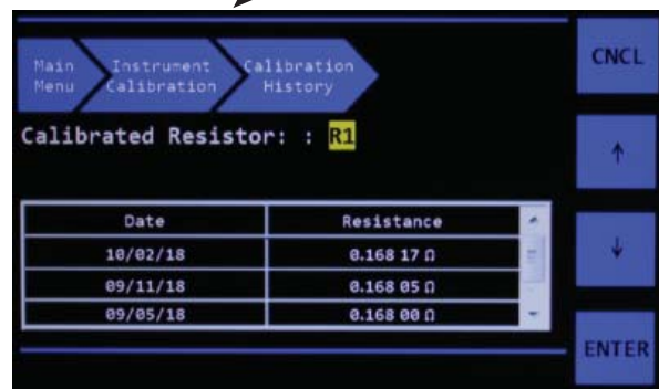
Calibration History Screen shows each calibrated resistor value and calibration date

Breadcrumbs allow easy navigation in menus